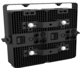
Blinder II IP Type A